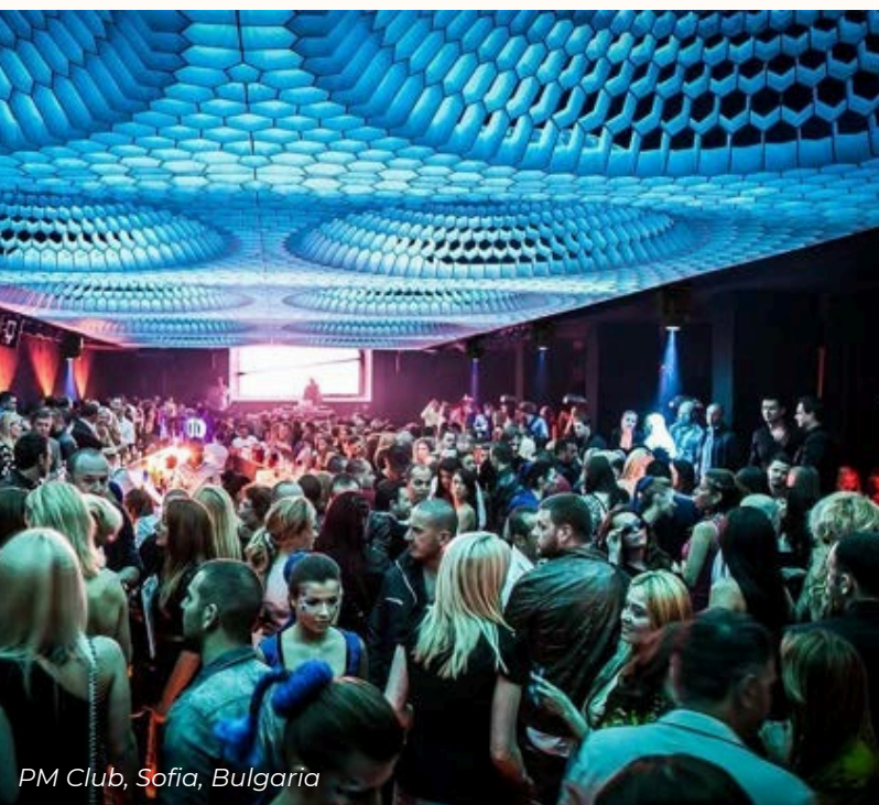
PM Club, Sofia, Bulgaria