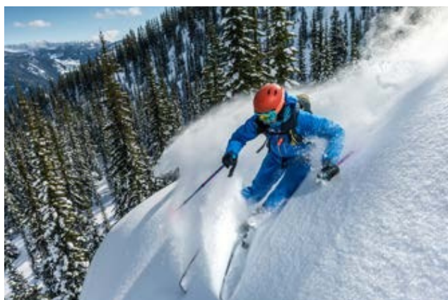
Ski and sun, Bansko and Borovets