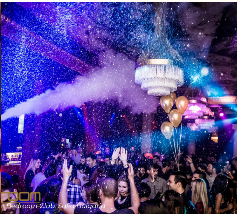
Bedroom Club, Sofia, Bulgaria