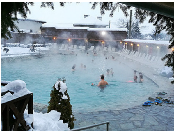
Hot springs, Bansko