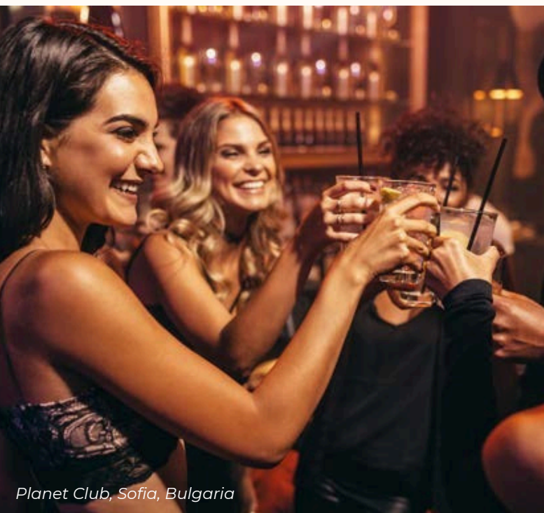
Planet Club, Sofia, Bulgaria